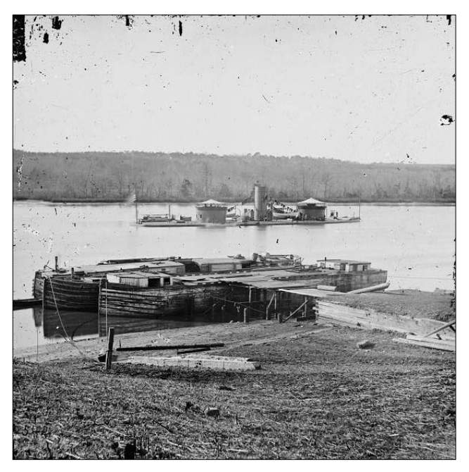
Barges moored parallel to the shoreline to create a temporary wharf, with a double-turreted ironclad in the background.

The survey and field school were deemed a success and proved to be one of the more enjoyable field schools MAHS has held in the region in terms of weather, as the November days were mild and sunny with a gentle breeze. The weekend provided a wealth of information and future opportunities for MAHS to map and survey a little explored aspect of the American Civil War from an underwater archaeological perspective. The event also provided a valuable training opportunity for students, as well as a controlled environment in which to develop appropriate low-visibility survey techniques for later use at the site. Lessons—learned in the areas of site preparation, equipment, and procedures