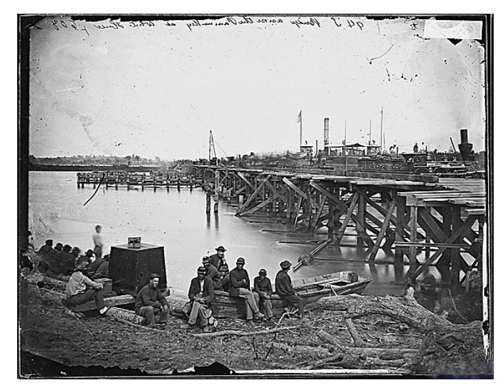
Bridge over the Pamunkey River at White House Landing under repair ca. 1862, with locomotive in right background.

creating the type of temporary wharf seen in historical photographs of the White House Landing.